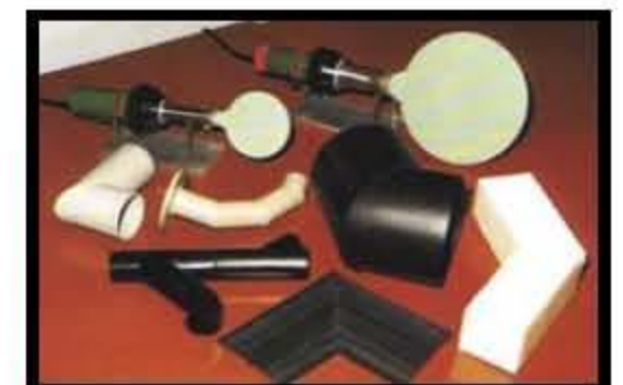
Pipe butt welding with welding mirrors