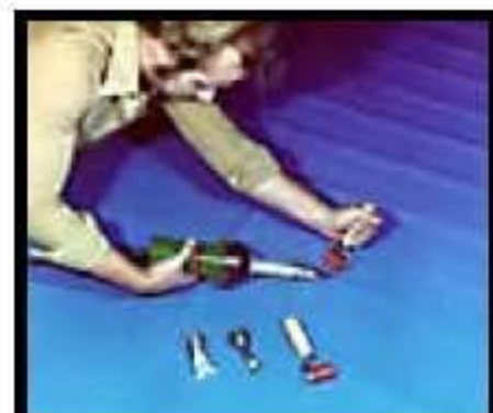
Truck tarps and liners